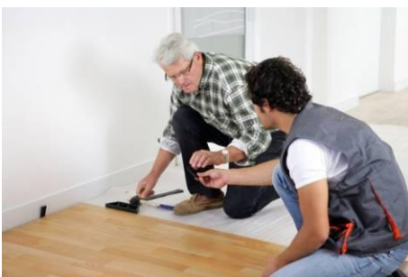
Lay a floorboard