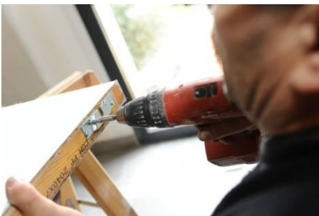
Screw something on