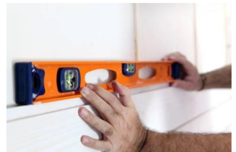
Check the level