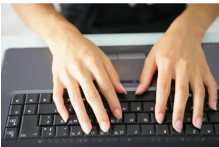
Type (out) (a report)