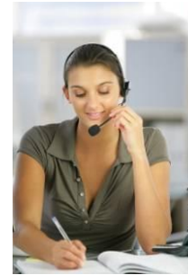
Make an appointment