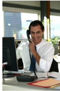
Make/take a phone call