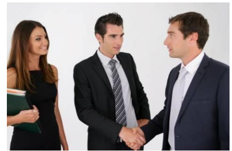
Welcome a client/a customer/a visitor