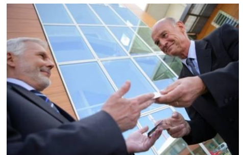
Exchange business cards