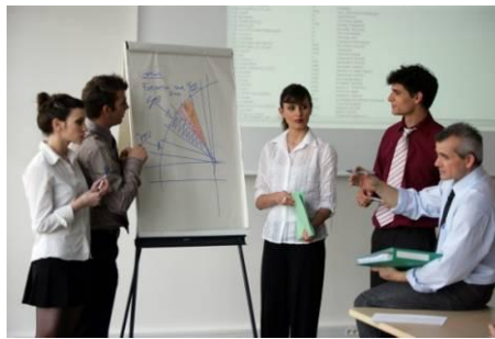
Make a presentation