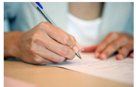
Fill in a document