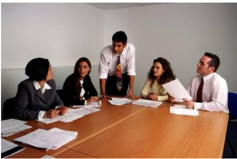
Attend a meeting