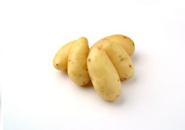
Potato / Potatoes Patate(s)