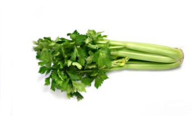
Celery Céleri branche