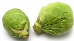
Brussel sprout Chou de Bruxelles