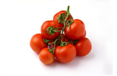
Tomato / Tomatoes Tomate(s)